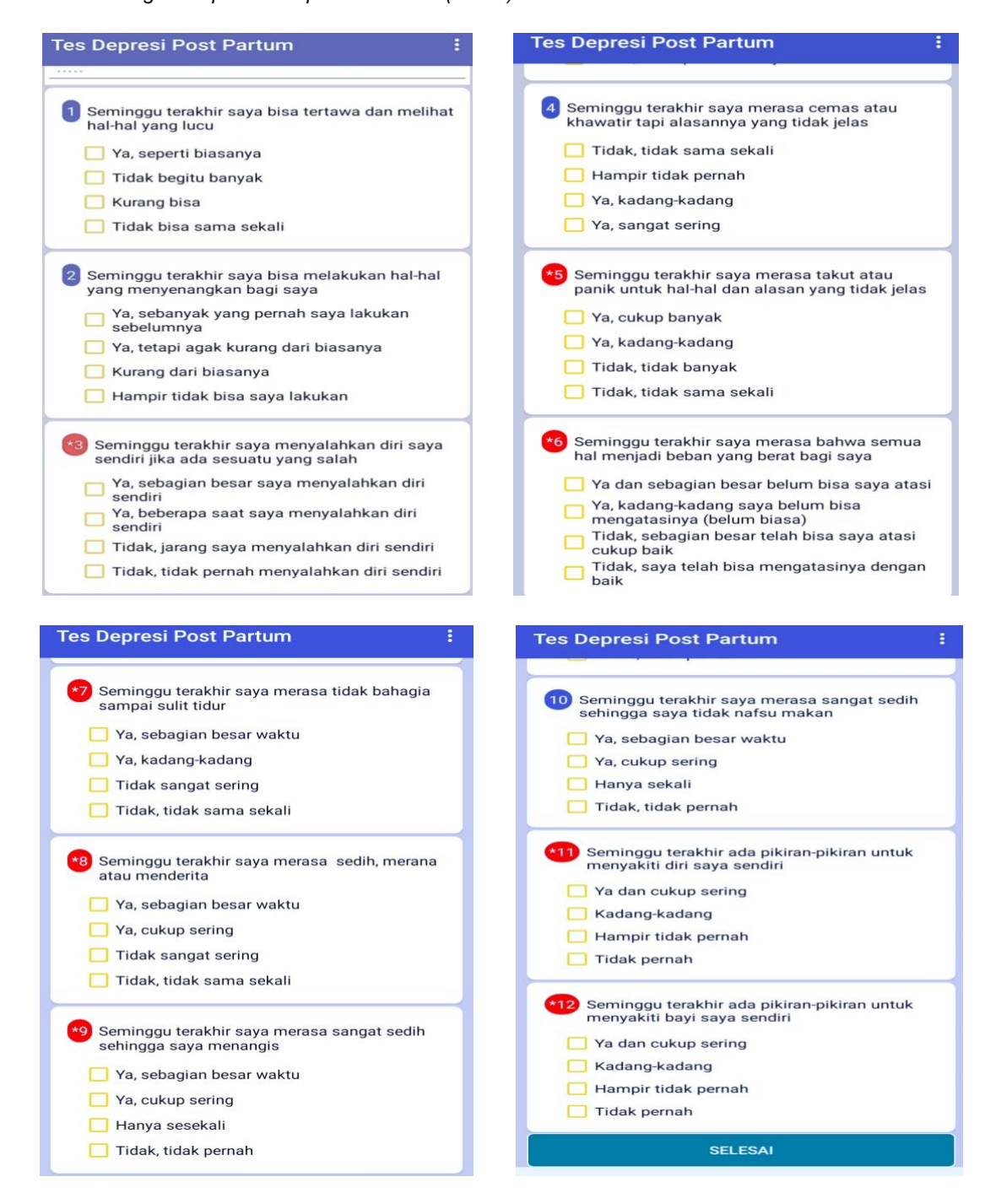
Figure 3 Modified EPDS - 12 items Indonesia version

Figure 3 shows the instrument used to detect postpartum depression using the Modified Edinburgh Postpartum Depression Scale (EPDS). The EPDS was developed by Cox, Holden, and Sagovsky (1987), and we had granted permission to use the instrument in this application. The original developer stated that the EPDS is not a diagnostic tool; therefore, we describe that our app is a tool for screening signs and symptoms of postpartum depression, not a tool for medical diagnosis of postpartum depression.