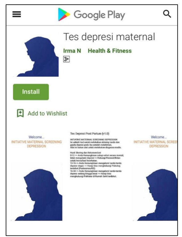
Figure 1 Cover of the application

Characteristics of mother and child In this app, a mother is asked to provide their information about the mother's picture, health personnel who recommended using the application (if any), socio-