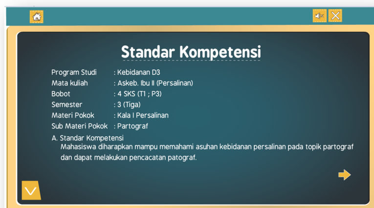
Figure 5 Screenshot of Competency Standard

Figure 4 shows the “Start” menu where there are many choices to view all the material subjects, glossaries, references, and the other features.