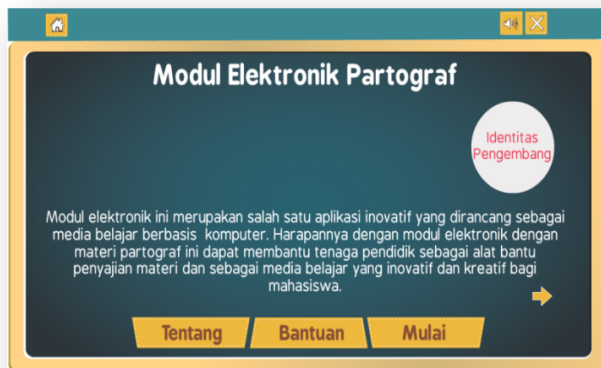
Figure 2 About Interface