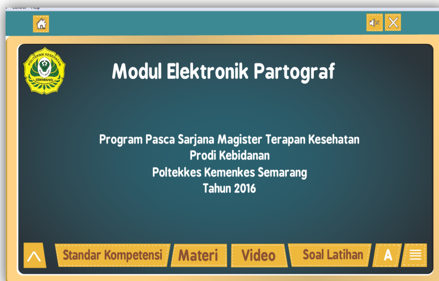
Figure 1 Cover of the E-Partograph

The e-partograph design interface was described in the figures below: