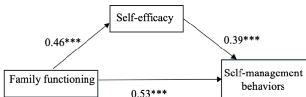
Figure 2 The mediation effect model diagram